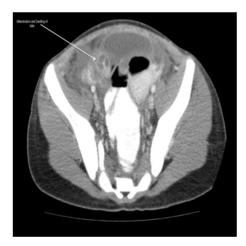
Fig 3.1 Input CT Scan.

Mean (\mu) is the average of all intensity value. It denotes average brightness of the image, where as standard deviation is the deviation of the intensity values about mean. It denotes average contrast of the image. Here I(x, y) is the intensity value of the pixel (x, y), and (M, N) are the dimension of the Image [6]. The results for the enhancement of satellite images and CT Scans are given in fig 3.1. The visual and quantitative result shows that the proposed method has increased efficiency and flexibility. The resultant images for the enhancement of satellite images are given below fig 3.3, the following resultant images of DWT-DCT-SVD gives the better contrast as well as high image quality.