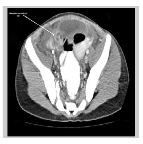
Fig 3.2 Output CT Scan.